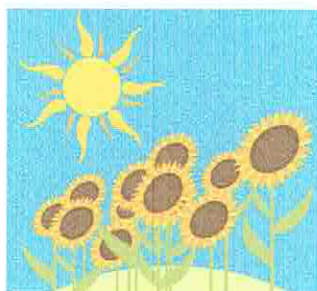
high in the sky