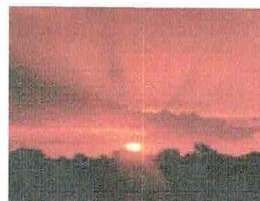
low in the sky