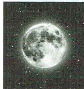
the moon and stars

5. A) When does the sunlight become less bright because the sun is moving lower in the sky?