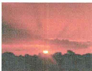
low in the sky

2. Where is the sun in the middle of the day?