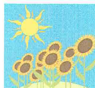
high in the sky